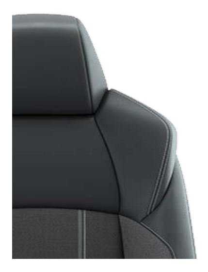
Black fabric and synthetic leather upholstery with grey stitching (Sol) (EA40)