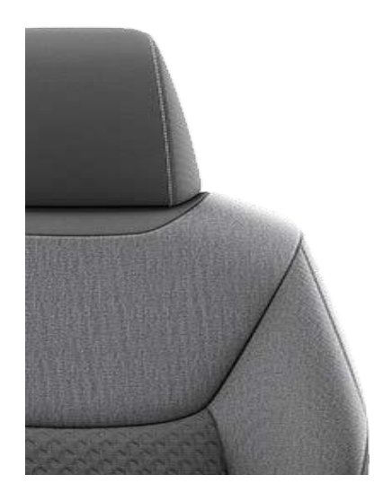
Black fabric upholstery with light black roof lining (Luna Sport) (FC20)