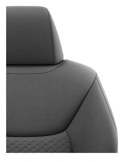
Black fabric upholstery with light grey roof lining (Luna) (FB20)