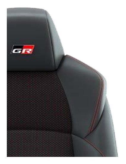
GR SPORT suede and synthetic leather upholstery with red stitching (GR SPORT) (EC20)